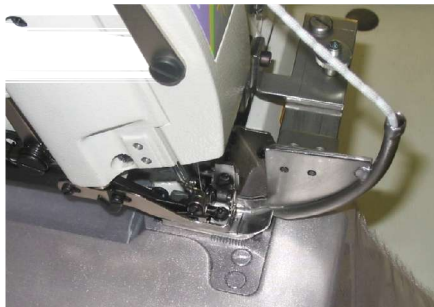
presser foot and guide for lead tape