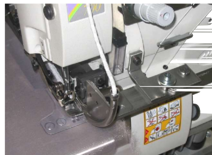
presser foot and bracket