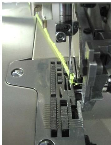
modified needle plate