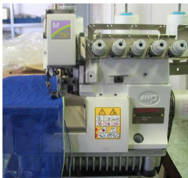
M732, prepared for turn-down hemming

Following conversion parts are required: