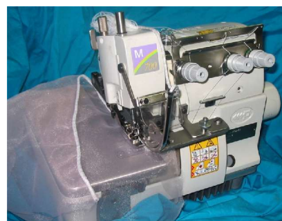
attaching lead tape